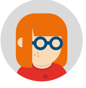
1. Early help

There will be early help for children who have social, emotional and mental health needs who need more support, close to them.